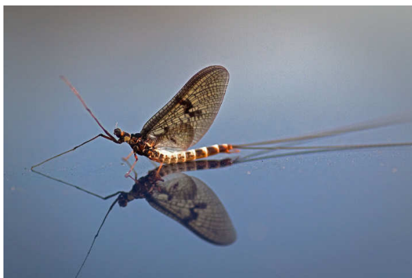
Figure 3. Drake mackerel mayfly ( Ephemera vulgata ) attracted to polarised light

There are a total of 278 species of mayfly, stonefly and caddisfly in Britain, eight of which are UK Biodiversity Action Plan (UKBAP) priority species for conservation action. All but the most polluted rivers in Britain support mayfly populations, therefore artificial lighting and sources of polarised light pollution around all rivers should be minimised 27 .