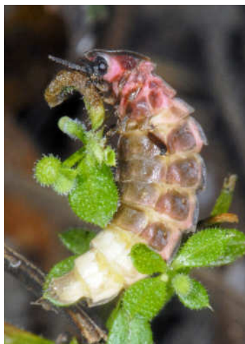
Figure 6. Glow-worm ( Lampyrus noctiluca )

Beetles of the family Lampyridae, which include fireflies and glow-worms, produce light (bioluminescence) to attract mates and prey 54 . The Glow-worm ( Lampyrus noctiluca ) is the commonest species of Lampyridae in Europe; this species is nocturnal and the flightless females produce a bioluminescence glow to attract flying males. There is some evidence that Glow-worms are declining in Britain and light pollution may be one of several contributory factors 55 .