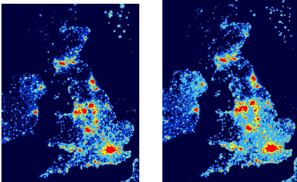
Figure 7. Light pollution in the UK in 1993 and 2000, courtesy of CPRE.

As shown in Figure 7 there has been a significant increase in the general light pollution from lighting in the UK. The growth in the use of artificial light at night is expected to continue. In their 2009 report into the problem the Royal Commission on Environmental Pollution highlighted that over 2.3 million of the United Kingdom's 7.4 million road lights were scheduled to be replaced over the next couple of years. It is likely that the prevalent yellow low-pressure sodium vapour lighting will be replaced by a broader spectrum lights that enable humans to discern colours, but which are of greater concern than yellow lights in terms of risk to invertebrate populations and wildlife.