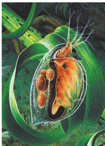
Figure 5. Common water flea ( Daphnia pulex )

Many invertebrates are known to be repelled by light; examples are some species of earwigs, cockroaches, woodlice, earthworms and scorpions 35,36 . Investigating