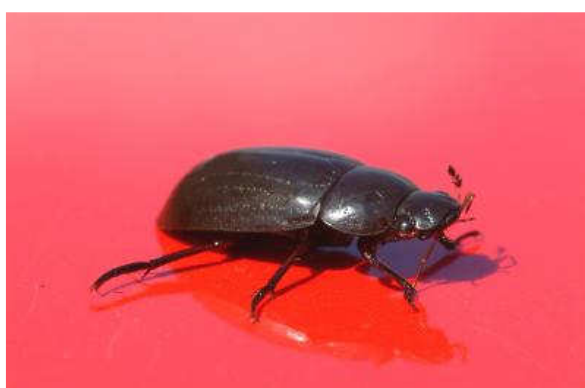
Figure 4. Lesser silver water beetle ( Hydrochara caraboides ), an endangered beetle that is attracted to lay its egg on cars, especially red ones. The coating of the eggs is acidic and eats away the surface of the car's paint

Other freshwater invertebrates are also attracted to artificial light, including aquatic beetles 18 . The Lesser silver water beetle ( Hydrochara caraboides ) is known to be attracted to polarised light pollution sources 32 . It is a UKBAP species, classed as endangered in Britain and is fully protected under Schedule 5 of the Wildlife and Countryside Act 1981 in England and Wales. It is possible that populations of this rare beetle could decline further due to the presence of artificial light and polarised light pollution near ditches and ponds where they are found.