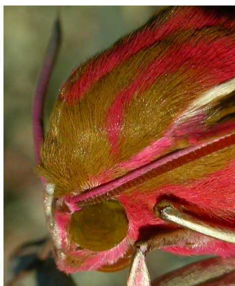
Figure 1. Elephant hawkmoth ( Deilephila elpenor )

Light and darkness are a major environmental influence in the lives of many animals, including invertebrates. Arthropods such as insects and crustaceans have compound eyes that are sensitive to a broad range of light. Most insects have a colour vision system that is based on three or four, sometimes five, types of colour receptor cells. Light wavelengths are measured in nanometres (nm) and most insects can perceive the spectral region from ultraviolet (UV) which has a short wavelength and high frequency (300 nm) to red which has a long wavelength and a low frequency (700 nm) 6 . UV light is used by terrestrial invertebrates in a variety of activities such as mate selection, navigation and foraging 7 . UV, green and blue light which have short wavelengths and high frequencies are best discriminated by insects, they are often much more sensitive to these wavelengths than humans are; while insects are generally insensitive to the red end of the spectrum. However, it is believed that some aquatic insects are more sensitive to red light than other invertebrates as it penetrates an unpolluted water column further than light with a shorter wavelength 8 . Some biting flies are also known to see infrared (>700nm) emitted from warm-blooded animals;